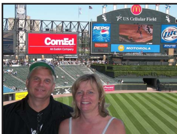
Interns and guests from the 19th Judicial Circuit enjoying an outing to a Sox game